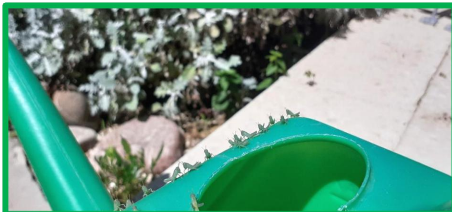
Baby grasshoppers gathering on a watering can