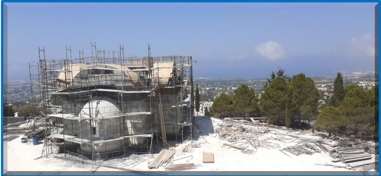
Rear view looking out over Paphos