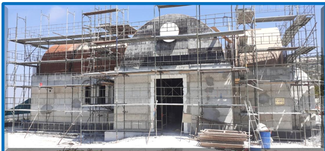
Close-up of the side