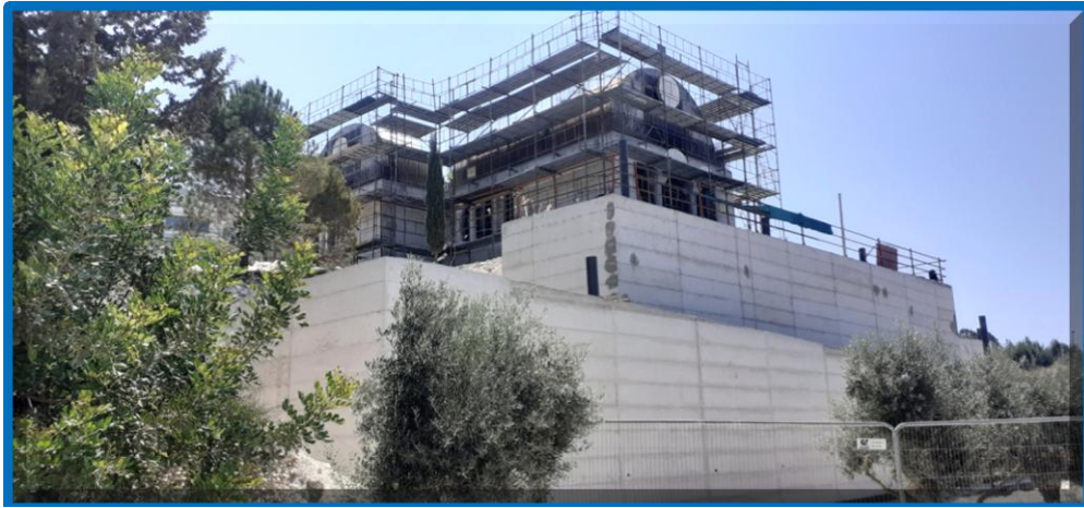
Looking up from the road